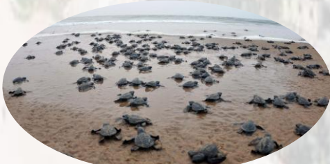
Olive Ridley Nesting Ground