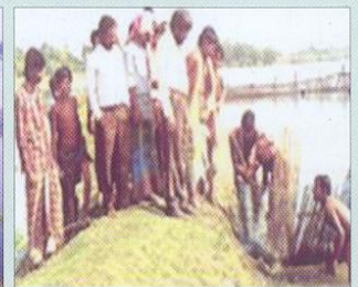
Erecting of pen in beel