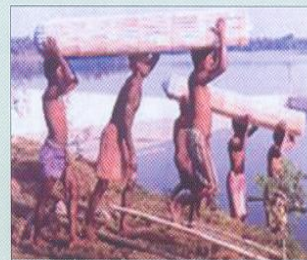
Material ready to install