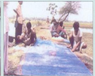
Fabrication using bamboo and nylon net