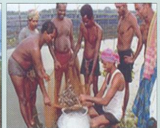
Harvesting prawns from pen