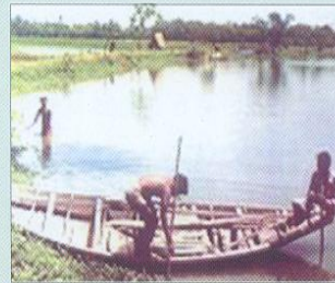
Site selection for pen